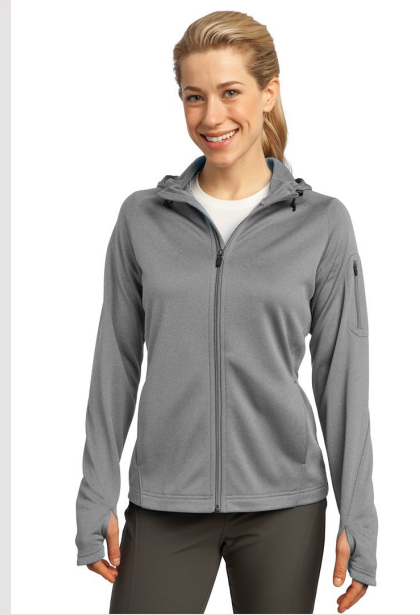
Sport-Tek® - Ladies Tech Fleece Full-Zip Hooded Jacket. L248

Made to perform during early morning runs or weekly errands, this feminine double-knit jacket keeps moisture under control and allows maximum movement. The hood with drawcord and toggles offers year-round versatility.