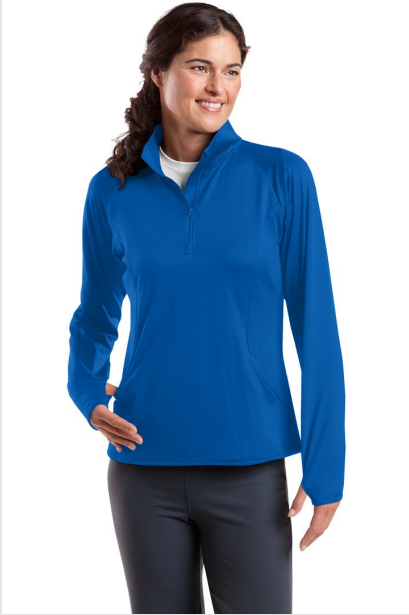
Sport-Tek® - Ladies Sport-Wick® Stretch 1/2-Zip Pullover. LST850

Ideal for year-round layering, our pullover is a true performance piece for running, yoga or just hanging out. Extra stretchy, this pullover has a soft-brushed backing and features Sport-Wick moisture-wicking technology for comfort. A 1/2 zip complete with zipper garage lets you control the ventilation.